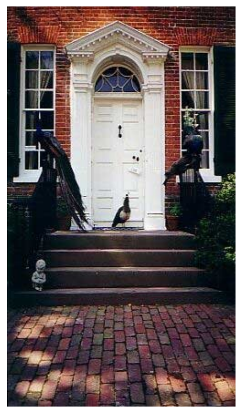
"Where the Past and Present Meet"

Individual and Group Tours Available March Through December