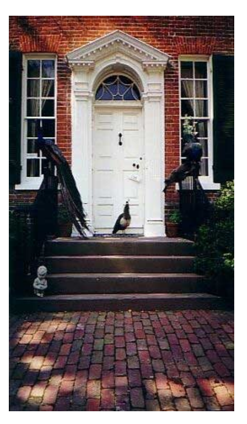
"Where the Past and Present Meet"

Group Tours for 12 or More People Are Available by Appointment, March Through December